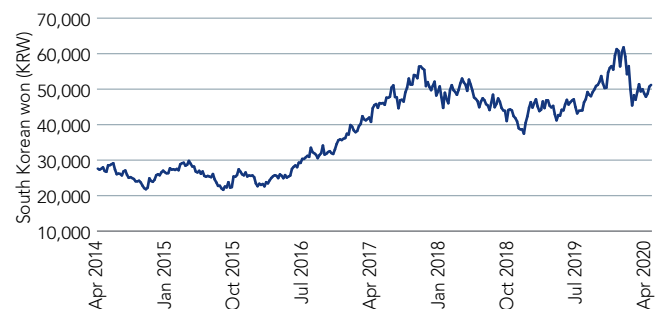
Figure 2. Since 2014, Samsung Electronics' share price has more than doubled