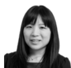
Sachi Suzuki Engagement EOS

We will continue to engage on its CAPEX plan as well as plans to increase renewable energy in its portfolio. We will also further press for extension of a net-zero goal to scope 3 emissions and a stretching absolute emissions reduction target for 2030.