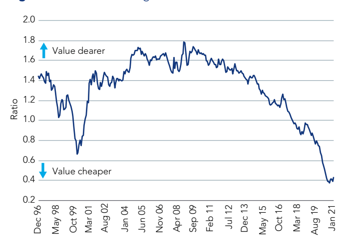
Figure 3. Asian value vs. growth

The ticker used for growth is the MSCI Asia ex-Japan Growth index and for value is the MSCI Asia ex-Japan Value Index.