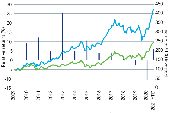
Figure 1. Performance: strategy v benchmark

Relative returns (LHS) — Federated Hermes Int'l Asia ex-Japan Equity (RHS) MSCI AC Asia ex-Japan Index (RHS)