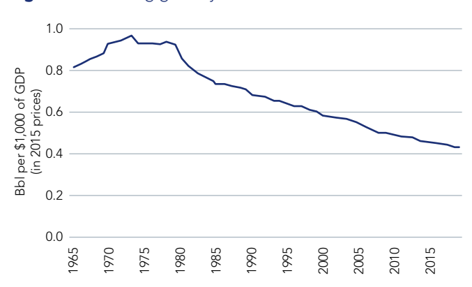
Figure 1: Oil's long goodbye