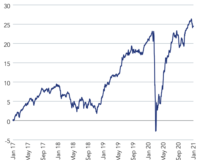
Figure 2: EMD hard currency performance under first Trump presidency