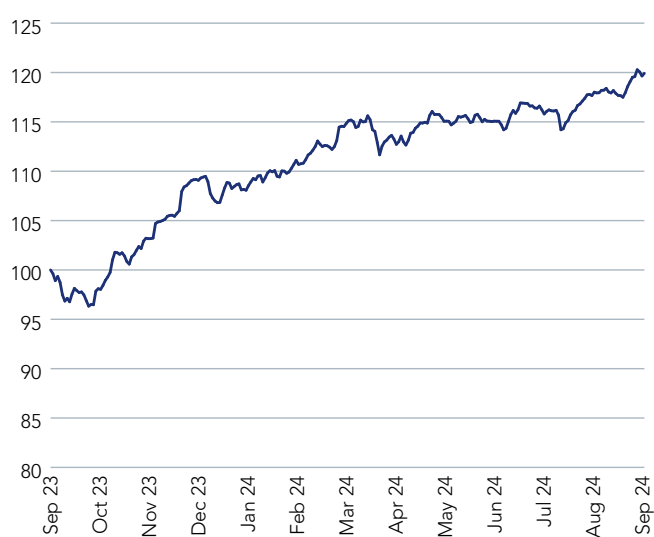
Figure 4: Frontier markets on the rise

Source: Bloomberg as at 26 September 2024. JP Morgan fixed income Next Generation markets index (rebased to 100). Past performance is no guarantee of future results.