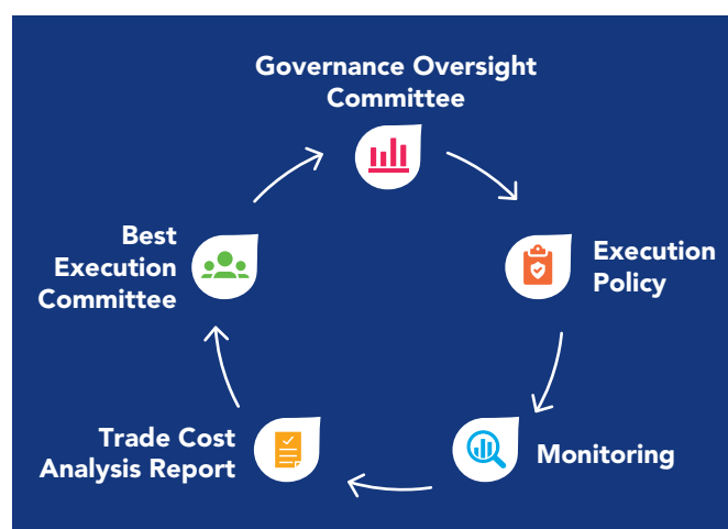
Figure 2 – Governance

Federated Hermes does not own any associate companies through whom it could conduct securities dealings.