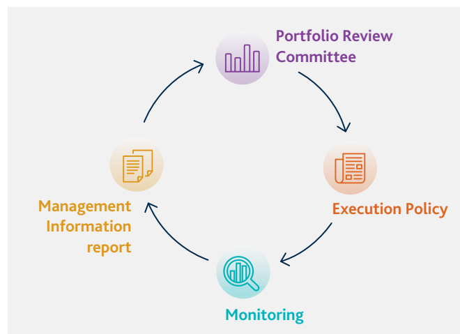
Figure 2 - Governance

Hermes does not own any associate companies through whom it could conduct securities dealings.