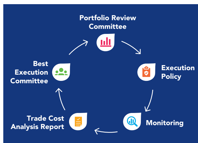
Figure 2 – Governance

Federated Hermes does not own any associate companies through whom it could conduct securities dealings.